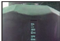
Molded-in gallonage graduation marks