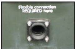
Lower fitting is a 2" bolt-on fitting with siphon for exceptional drainage.