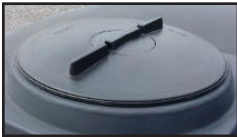
Molded-in platform for 18" or 24" lids aids in leak-proofness.

Snyder provides a wide range of above ground storage tanks for indoor or outdoor use where wells do not meet the consumption needs of the users. All Snyder water tanks are manufactured from FDA compliant resins and manufactured in NSF inspected facilities. Optional fittings are available.