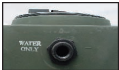
Top Fitting is a 1 1/2" polypropylene bulkhead fitting for float valves.