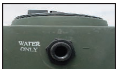
Top Fitting is a 1 1/2" polypropylene bulkhead fitting for float valves.